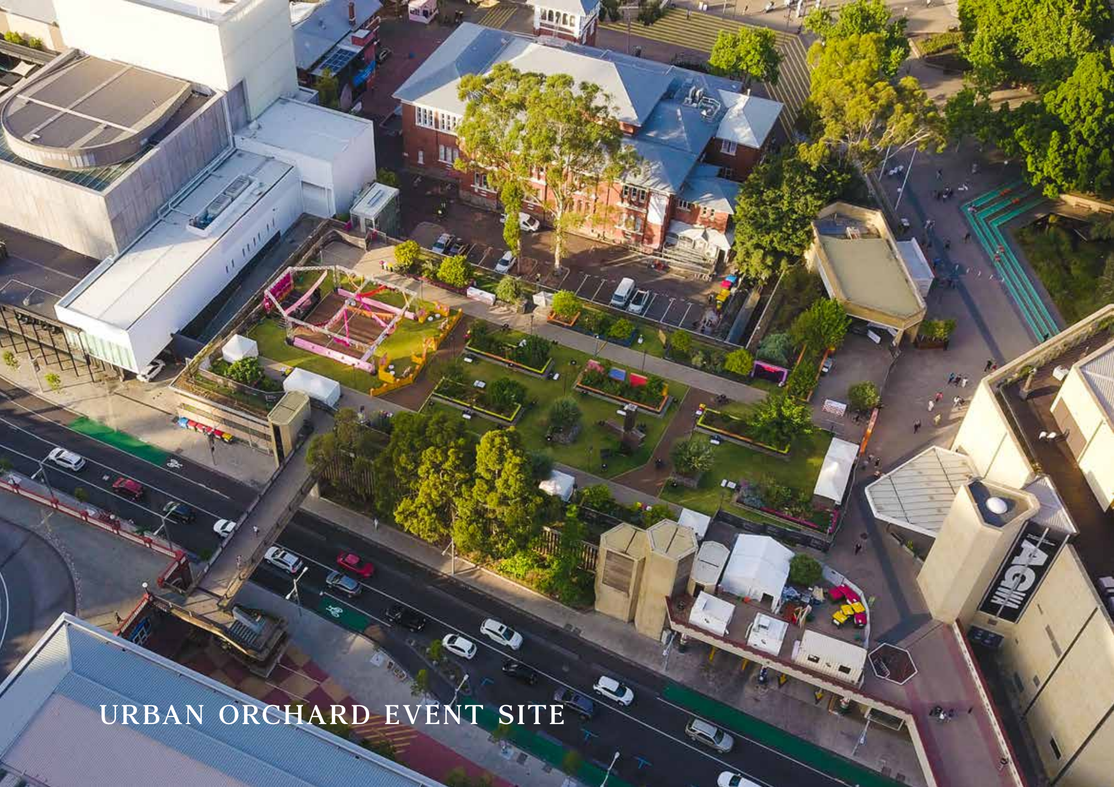
URBAN ORCHARD EVENT SITE